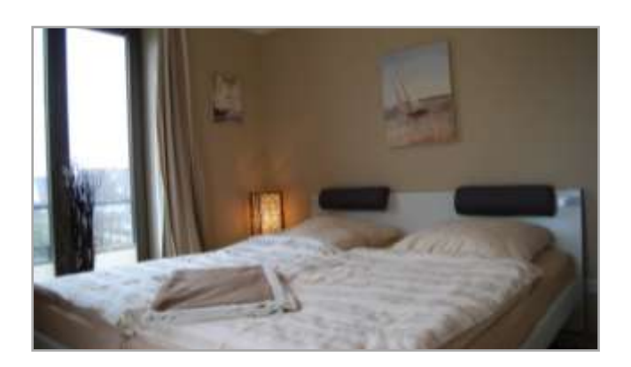
Bedroom with double bed