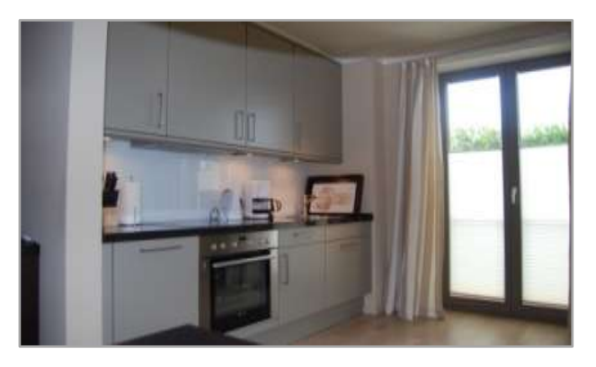
High quality kitchen with granite worktop