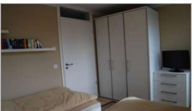
Guest room with Cabinet and LCD-TV