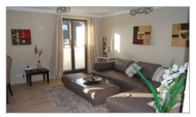
Living room with 1 – 2 additional berths