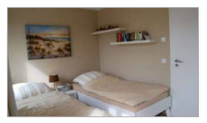
Guest room with 2 single beds