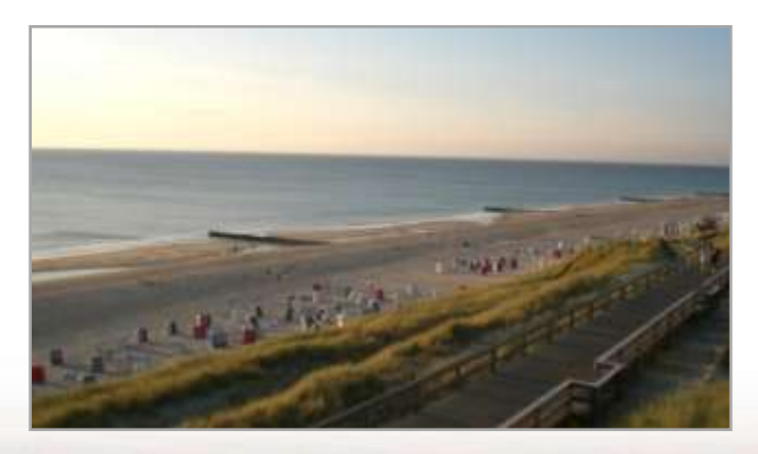
Beach von Wenningstedt