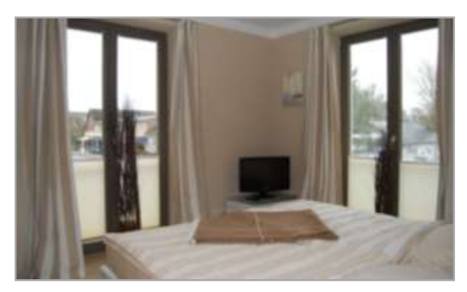
Bedroom with LCD-TV

Familie Feldt Steingarten 48 D-42699 Solingen