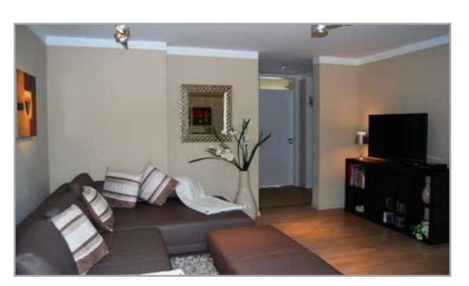
Living – room with LCD-TV and free Internet-access