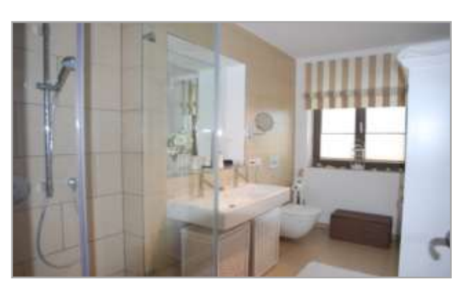
Design bathroom with rain-dance-shower