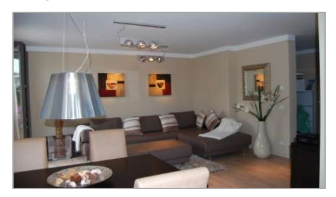
Living room / Dining room