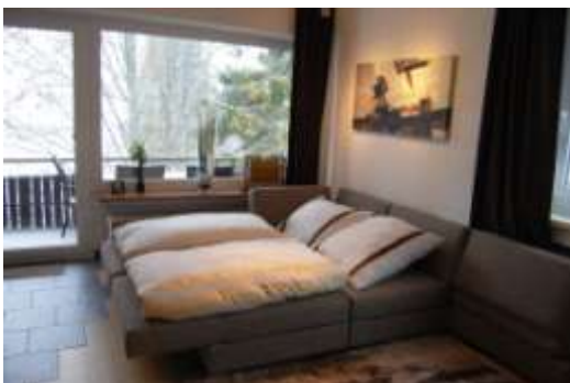
Big sofa which can be converted into a double bed