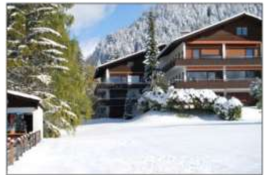
Parking places directly in front of the house