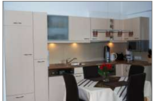
Fully open equipped kitchen with microwave, refrigerator with freezer, 4-ring ceramic