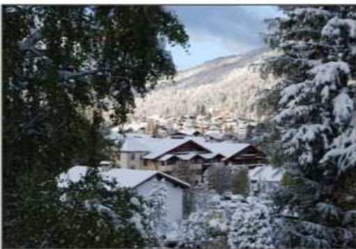
View of Seefeld in the living room window.

Fully equipped kitchen with microwave, refrigerator with freezer, 4-ring ceramic hob, coffee maker, kettle etc.