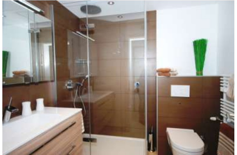
Bath room with Rain-Dance- shower, WC ,double washbowl,...

Fully equipped kitchen with microwave, refrigerator with freezer, 4-ring ceramic hob, coffee maker, kettle etc.