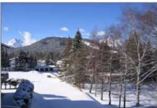
View from balcony in summer and winter