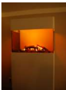
Cozy colored electric steam fireplace