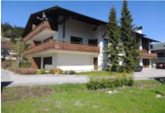
The house from the site

Here are further pictures of the apartment: Geigenbühel I*****