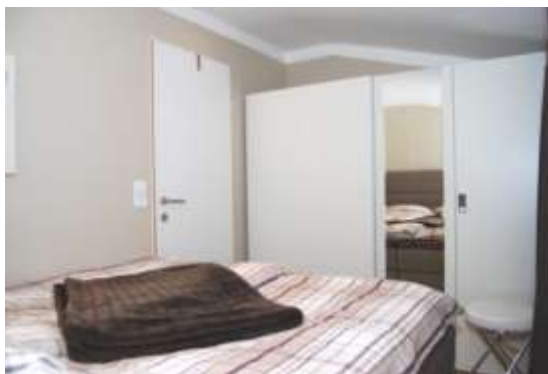
Bed room with wardrobe and mirror

Here are further pictures of the apartment: Geigenbühel I****