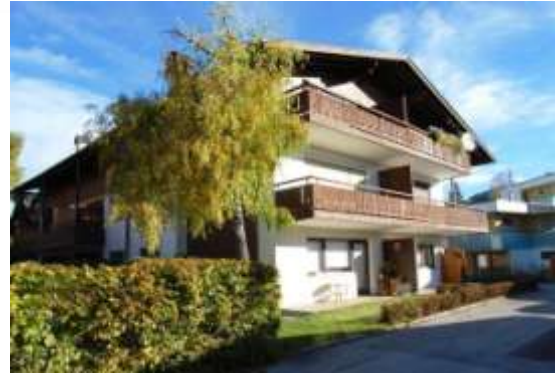
The apartment is on the 2. Floor on the left site.