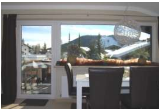
View from the dining table