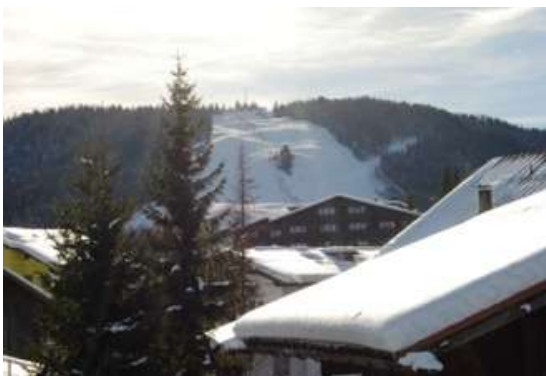
View from the balcony the Gschwandtkopf