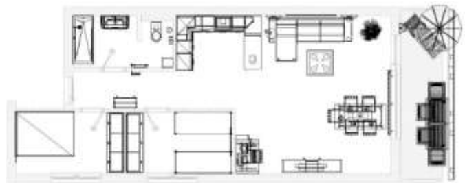
Original ground plan

Guest room/ Children's: In additional guest room or children's room there are 2 single-spaced boxspring beds with a 22" LED TV and a wardrobe with a full length mirror.