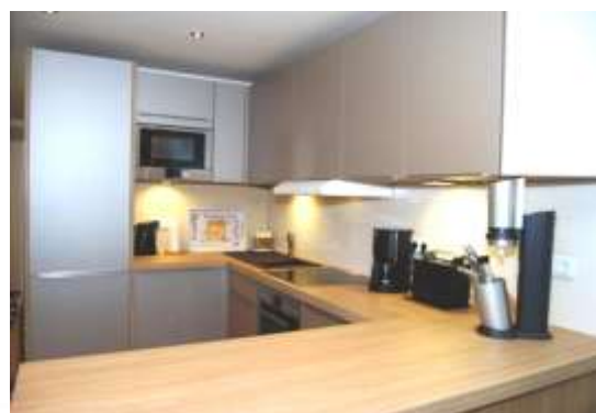
Open fully equipped kitchen

Tanja und Alexander Feldt Steingarten 48 42699 Solingen Germany