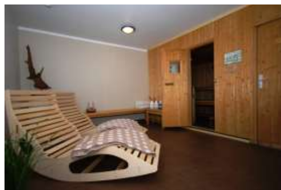
Finnish sauna (coin-operated) for own use with cold room and shower facilities.