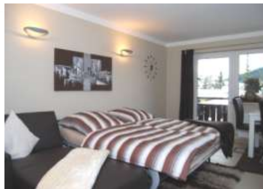
leather sofa with integrated double bed