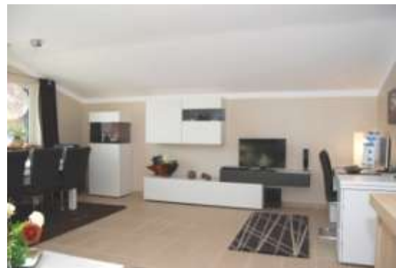
Living room with cozy electric fireplace